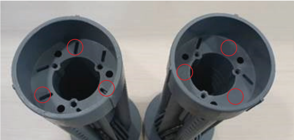
Ports that were not in use were removed