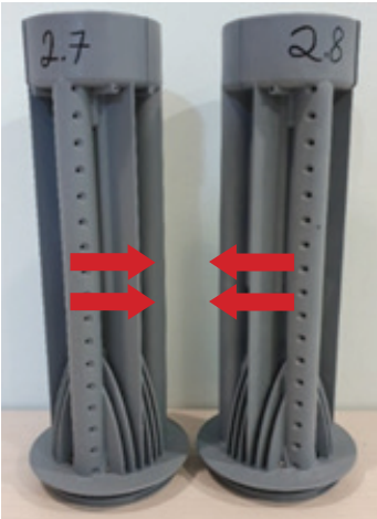
Change of direction in the spray nozzles